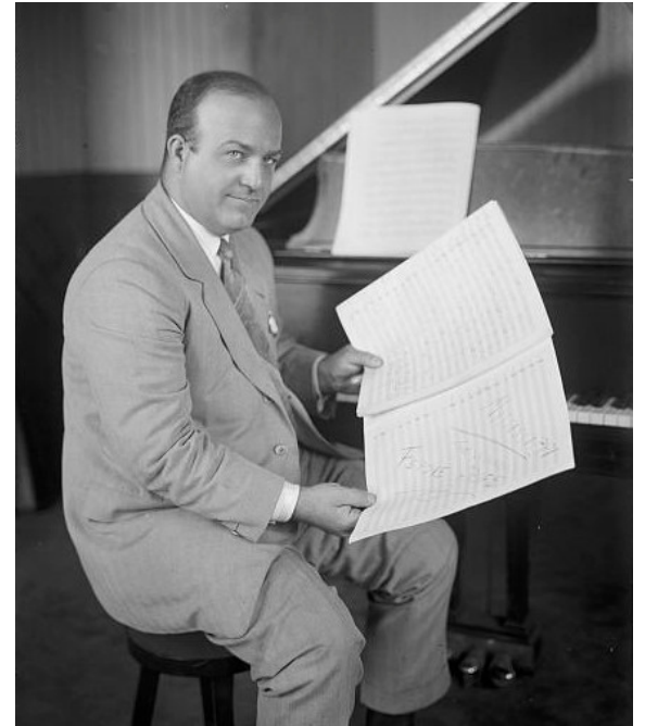
Ferde Grofé dropped out of school and tried various jobs before becoming a beloved American composer.