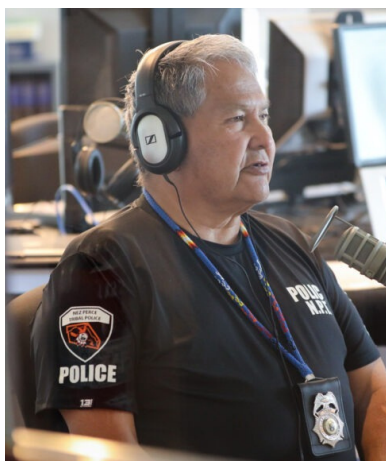
Episode 20: On Changing the Culture of Policing