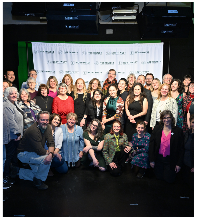
NWPB staff celebrating the station's 100 years.