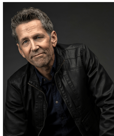
Episode 24: Jess Walter on the Crossroads Between Humility and Confidence